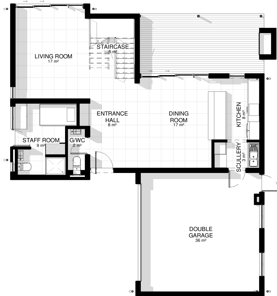
GROUND FLOOR LAYOUT