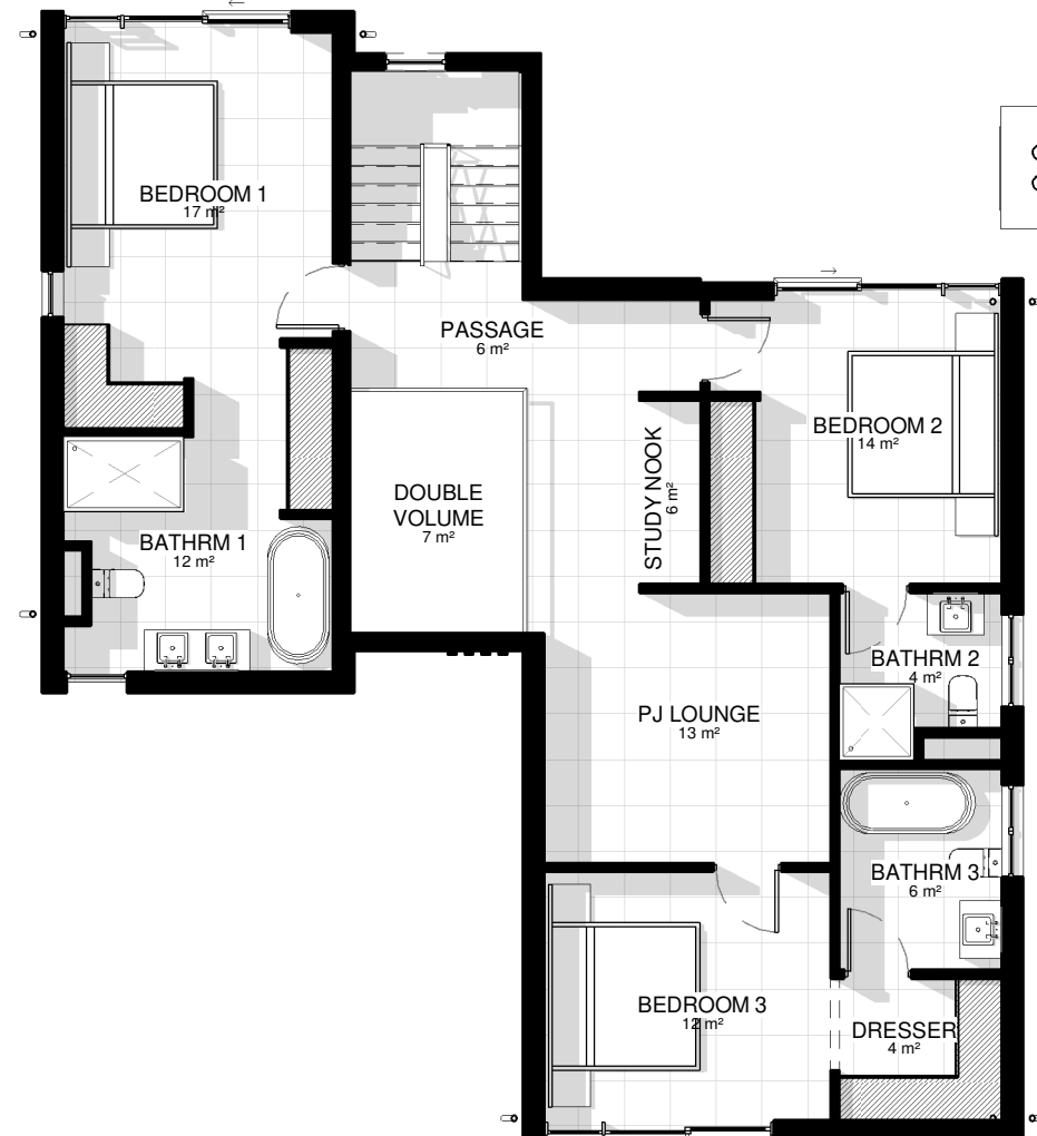
FIRST FLOOR LAYOUT